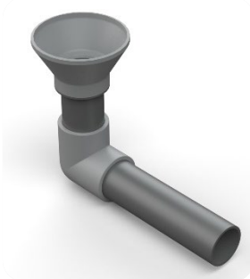
■ Cone diffuser ■ Cono difusor