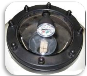
■ Transparent top lid with screws ■ Tapa superior transparente con tornillos